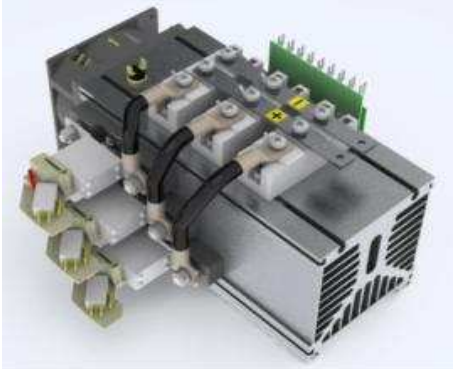
Thyristor Module stack