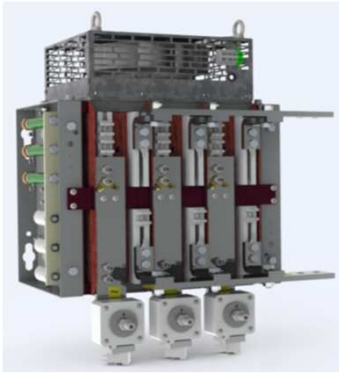
Thyristor/Diode Presspack stack