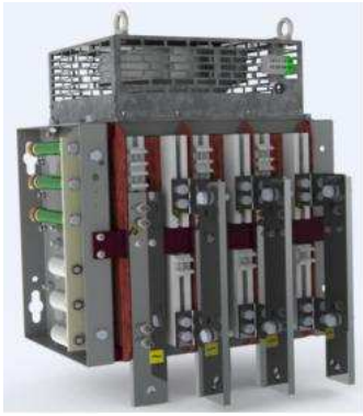
Thyristor Presspack stack