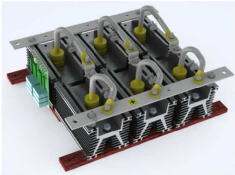
Thyristor/Diode Stud stack